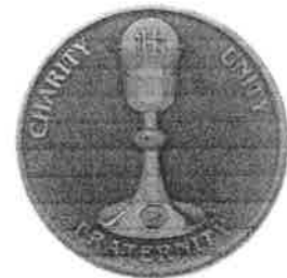
Existing Die# H-15-23 #A015216 Reverse 1.5 inch Antique Bronze Coin Approximate Size