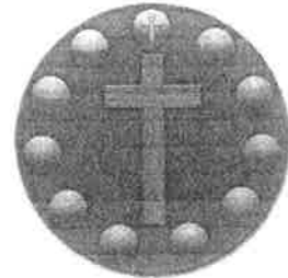
Existing Die# H-15-22 #A015215 Obverse 1.5 inch Antique Bronze Coin Approximate Size